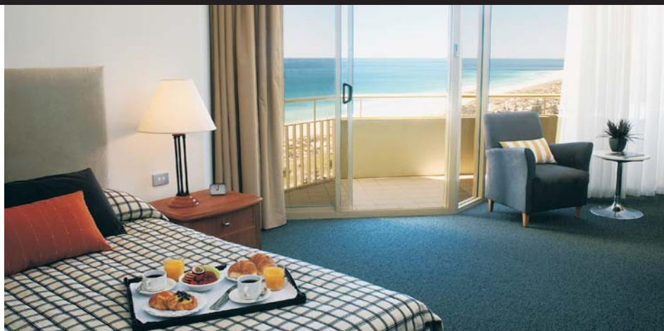
Deluxe ocean view room